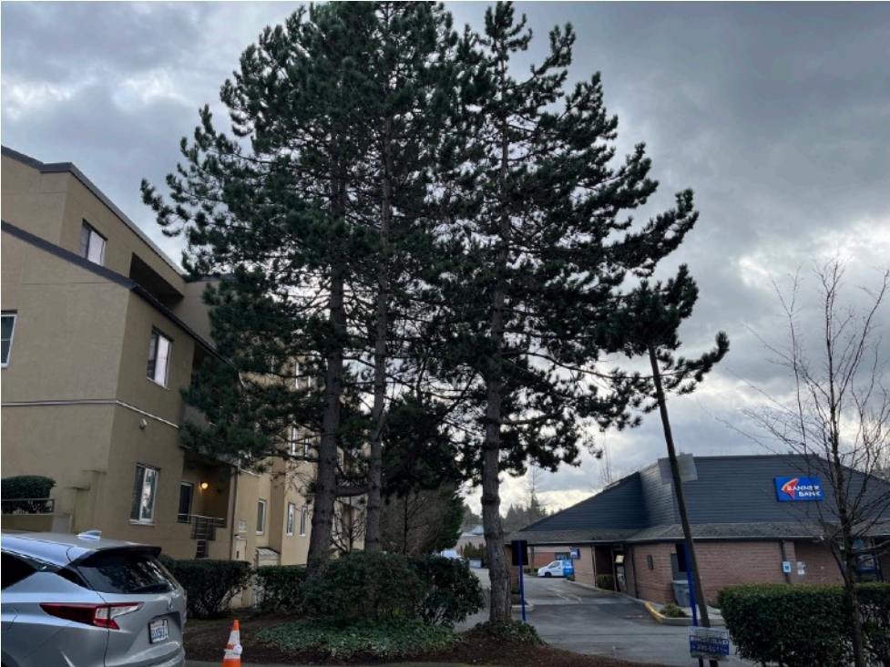
Trees #5-7 above