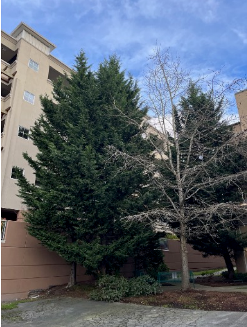
Trees #1-4 above